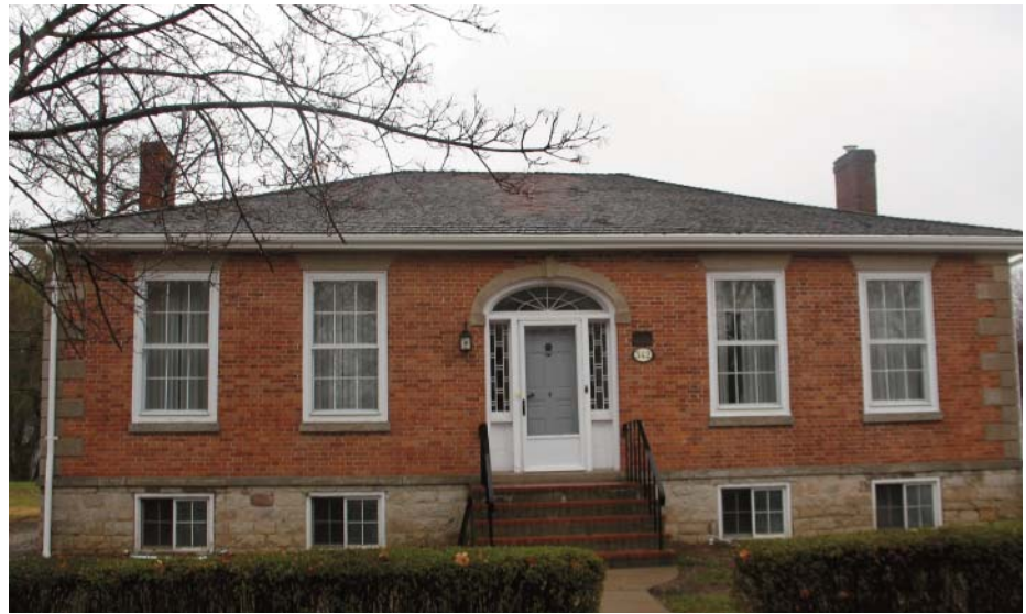
The manse without its dormer window.

We have also awarded a contract for repainting the interior trim.